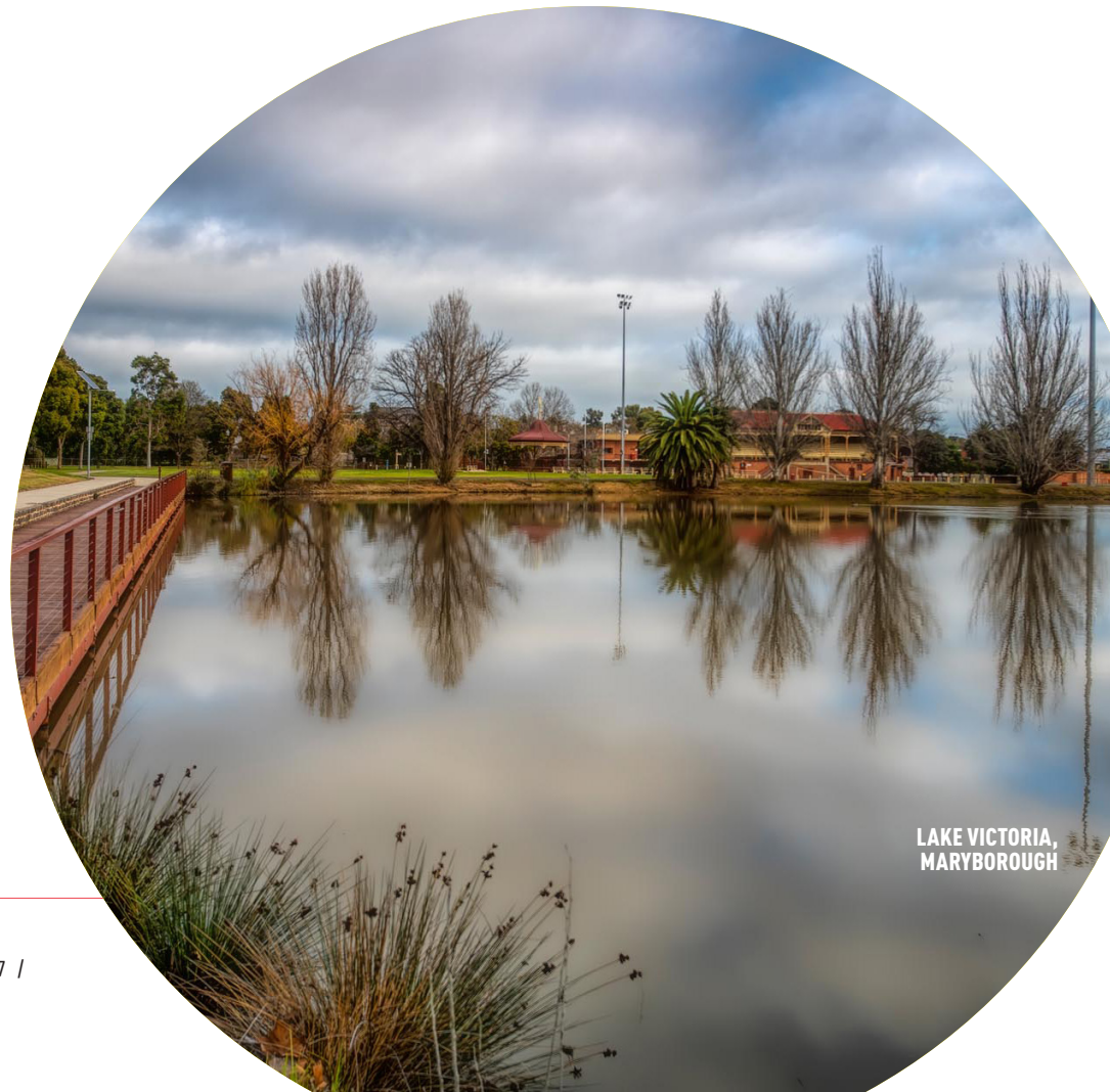
LAKE VICTORIA, MARYBOROUGH