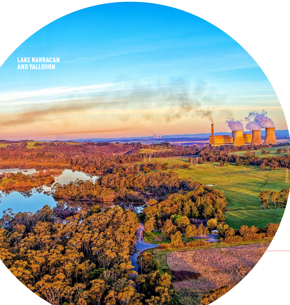
LAKE NARRACAN AND YALLOURN

The Gippsland coast, growing regional cities and rural hamlets provide plenty of scope for moving to the country for a lifestyle the envy of many. Population centres such as Warragul, Wonthaggi, Sale, Bairnsdale and Orbost offer the benefits of larger townships with easy access to the coast and mountains that define the region's southern and northern borders.